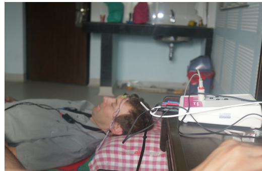
Neonatal Hearing Equipment