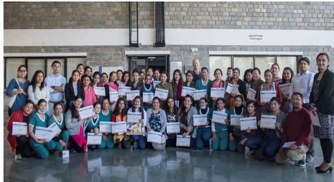
Nurses and Ear Care Worker Training

The Ear Centre held a training event for nurses from GPH and around Pokhara on 16th March. Over 40 nurses participated from at least 5 institutions. We held sessions on basic ear anatomy, common ear problems, hearing loss, types of ear operation, surgical instruments and their care, and post-operative care, and ear syringing. The feedback forms gave us very good marks for all the content and there was a clear request for further meetings with suggestions for topics.