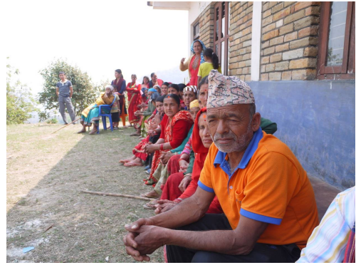
Patients waiting for their turn during the Ear Camp

One day free Ear Outreach was held in Jana Jyoti Adharbhut Bidhayalya at Nirmalpokhari on 25 th March 2018. 11 team member attendants and 150 ear patients seen in 5 hours. The Outreach was successfully done and the community was benefited. Local youth club and mother group were assisted which was very helpful.