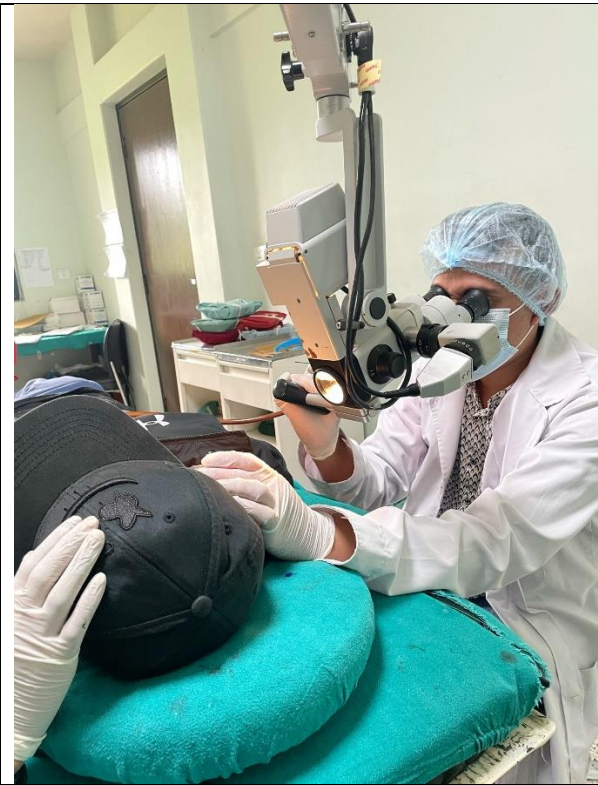
Patient undergoing micro suction.