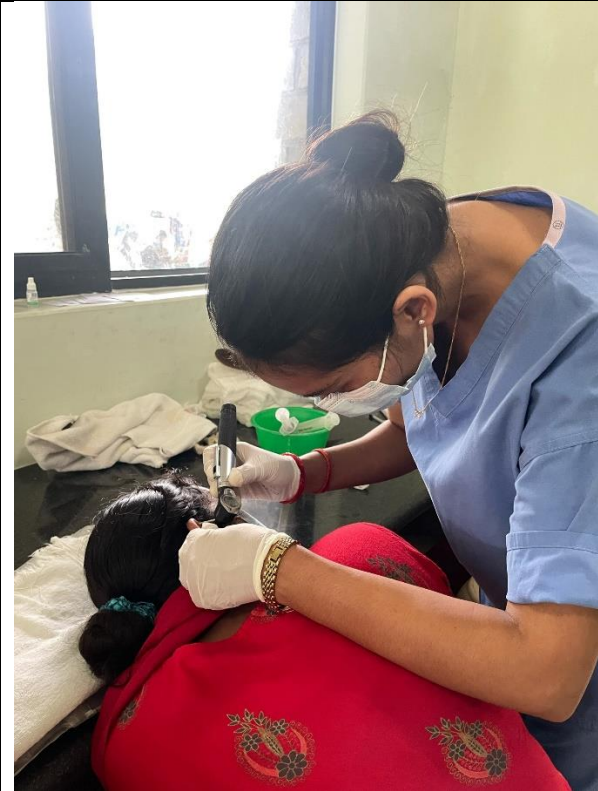
Patient undergoing syringing.