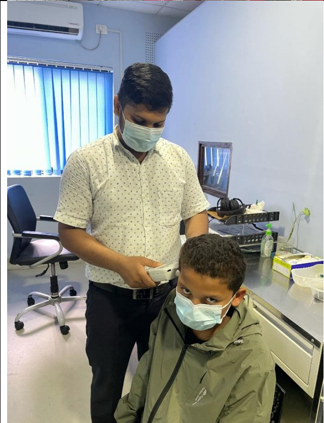
Patient undergoing hearing test.