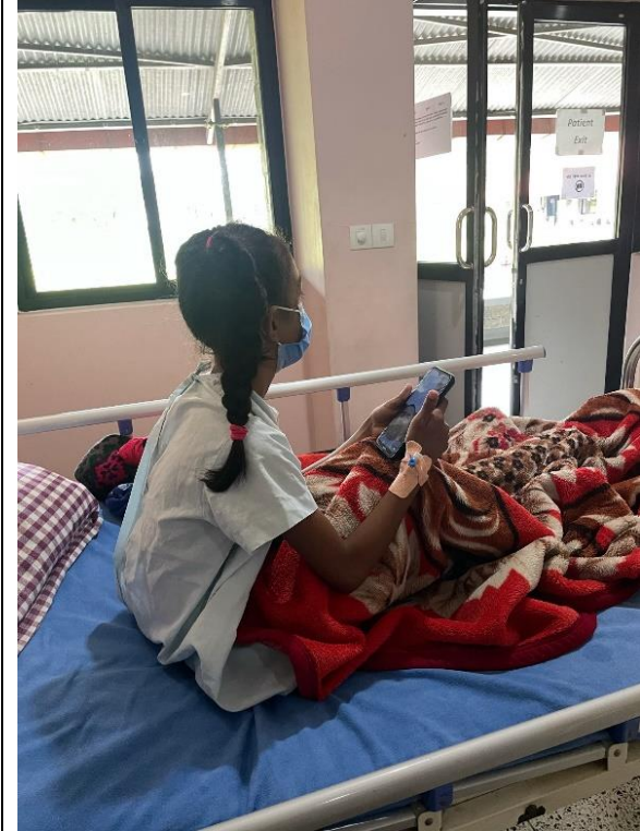
A patient in the ward waiting for her ear surgery.