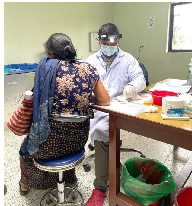
Patients checkup at OPD clinic.